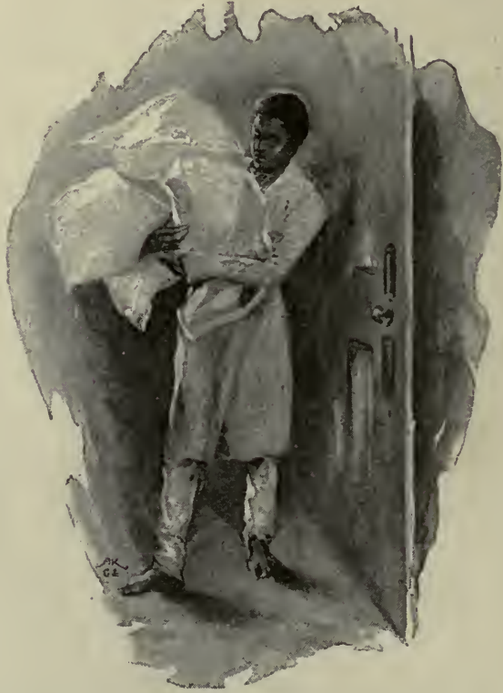
MET ONE COMING OUT OF MY BEDROOM.

so differently from what I expected. I accounted for it to myself in various ways, the most alarming of which was an idea